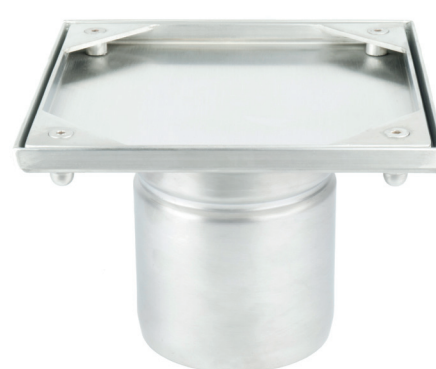
Tile Inset Cover