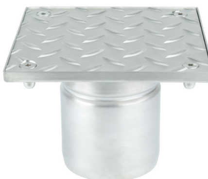
Chequer Plate Cover