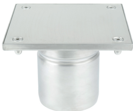
Flat Plate Cover